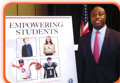
Tim Scott United States Senator

A handwritten signature in black ink that reads "Tim".